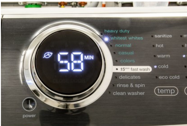
This is the Best Washer and Dryer Pair You Can Buy