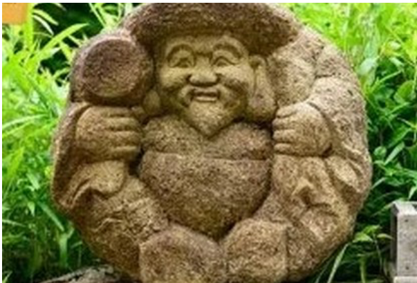
You Won't Believe What The Chinzanso Hotel, Tokyo Has Inside