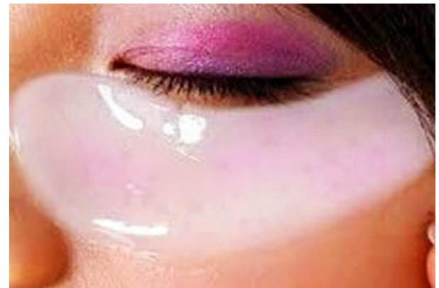
[Shocking] Remove Your Eye Bags & Wrinkles In 1 Minute!