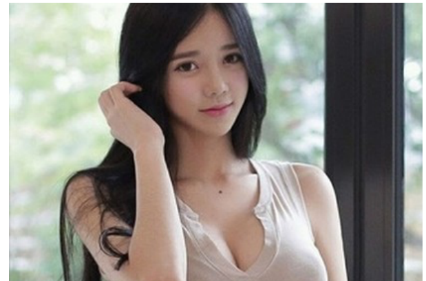
Cute Asian Babes Want Older Men