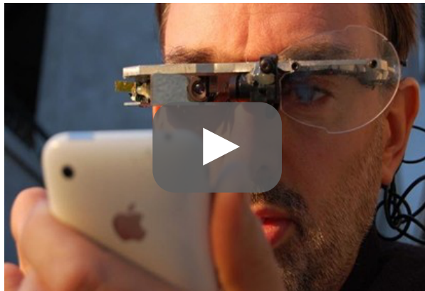
Vision Breakthrough? 'Restore' 20/20 Vision in 7 Days