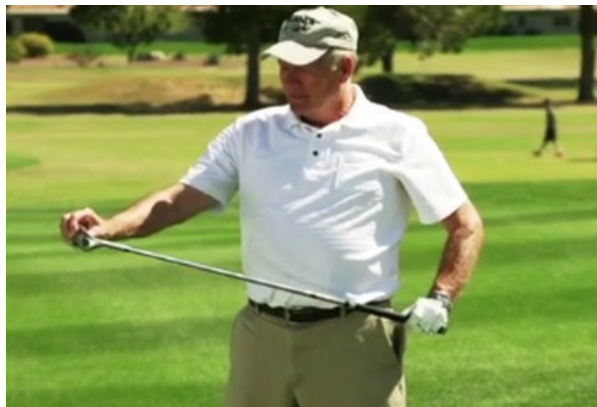
Golfers: Do This For A Perfect Flop Shot