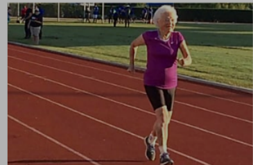
Feeling Old? Do This Once A Day And Watch What Happens