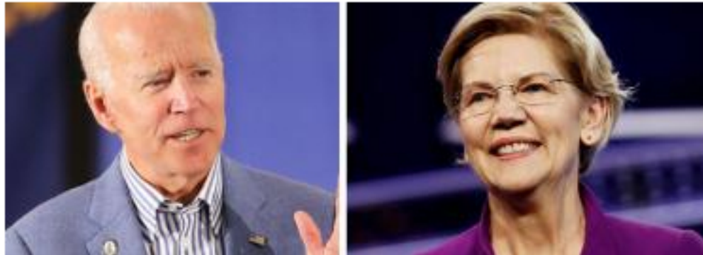
Joe Biden, Elizabeth Warren

By SUNSHINE STATE NEWS September 18, 2019 - 1:15pm