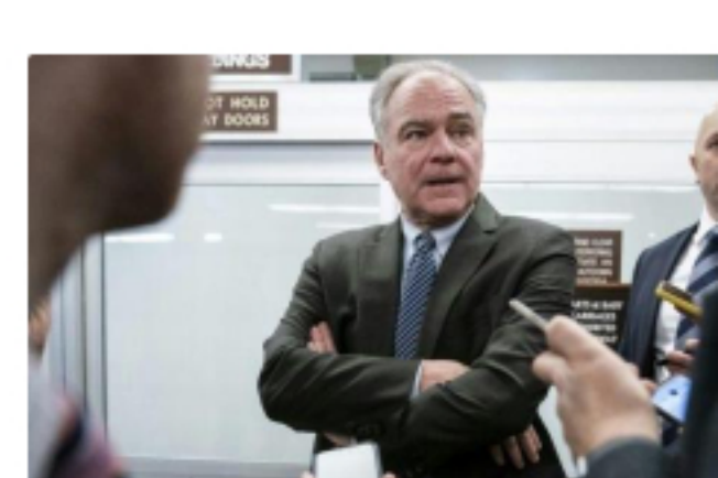
US Senate votes to restrain Trump on AFP