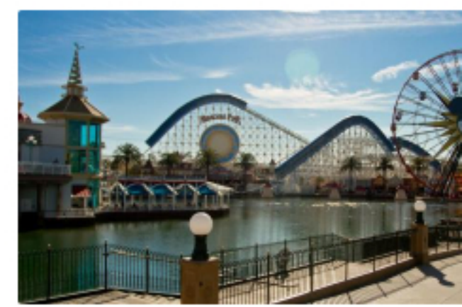
Fans react to Disneyland ticket price will not be going there' Fox Business