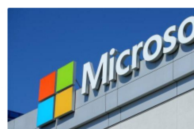
U.S. judge orders temporary halt to work on Pentagon's JEDI contract Reuters