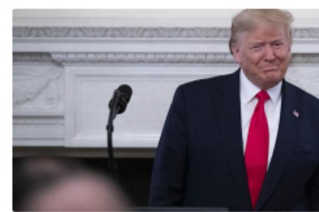
Trump says he would vote for a gay candidate Politico