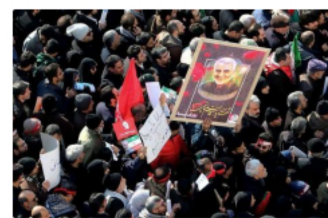
Senate passes bipartisan resolution to Trump's war authority on Iran ABC News