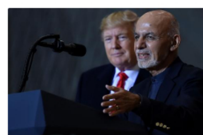
US-Taliban peace deal 'on the table,' says Defense News