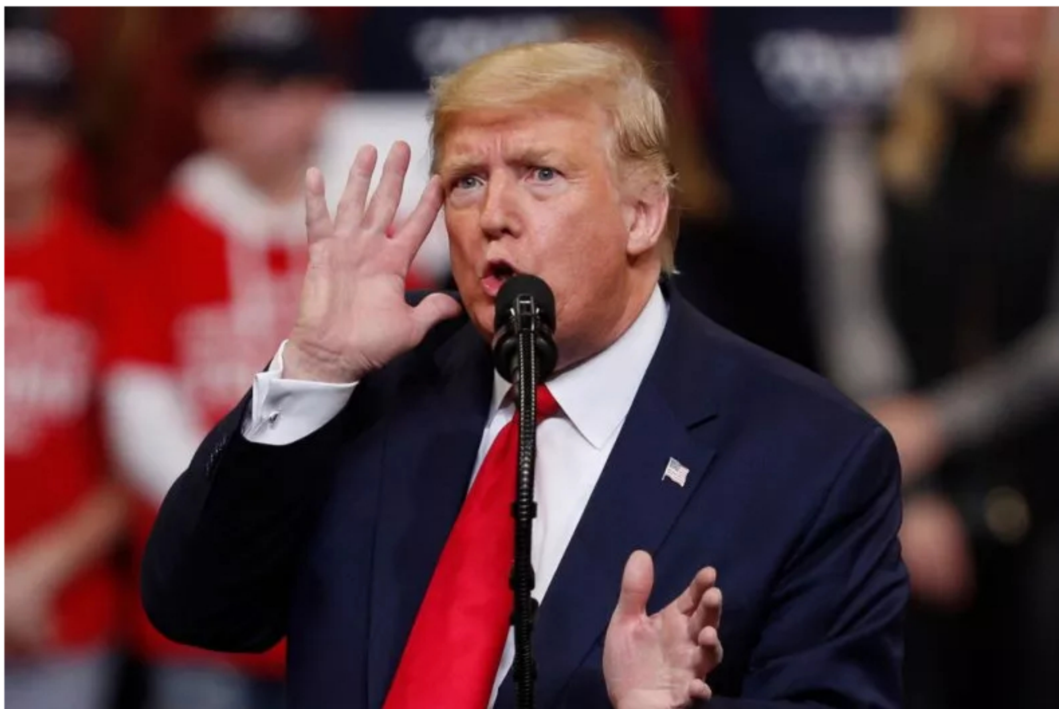
President Donald Trump speaks at a campaign rally inside of the Knapp Center arena at Drake University on January 30 in Des Moines, Iowa

The results were similar when respondents were asked about a match-up between Sanders and Trump. The incumbent president was backed by 53 percent of respondents, while the senator from Vermont was supported by just 41 percent. An additional 6 percent of respondents said they were not sure who they'd vote for.