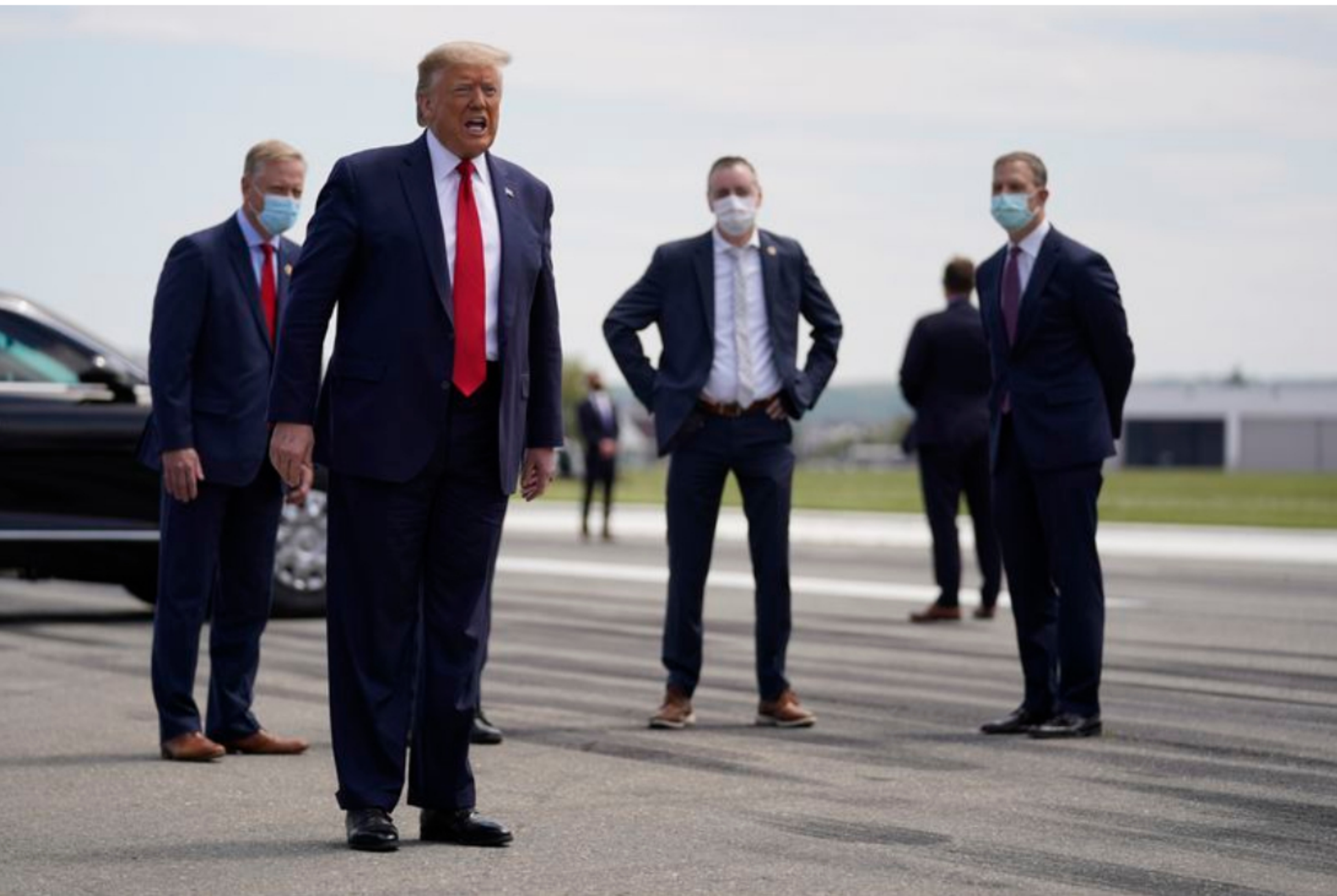
President Donald Trump speaks after exiting Air Force One at Lehigh Valley International Airport in Allentown, Pa., on May 14, 2020.

Florida voters' assessment of President Donald Trump's handling of the new coronavirus has declined significantly with the visibly widespread effects of the pandemic now in their third month.