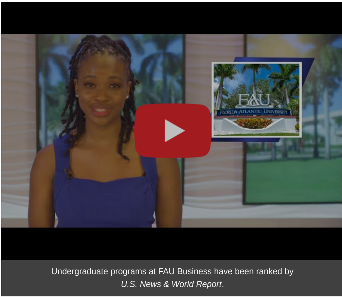
Undergraduate programs at FAU Business have been ranked by U.S. News & World Report .